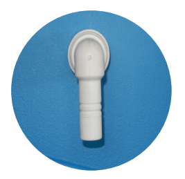
Fresh water inlet on back of unit