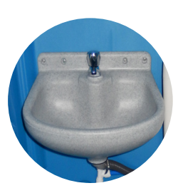
Large wash basin