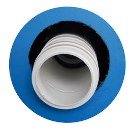
Waste water exit on back of unit