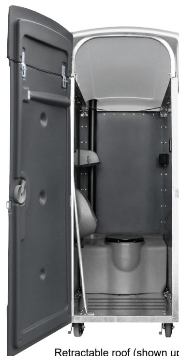
Retractable roof (shown up)