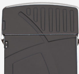
Retractable roof (shown up)