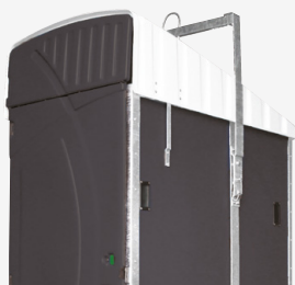
Kit to lift the Highrise with a full or empty tank