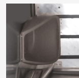
Standard equipped with 2-roll paperguard and urinal.