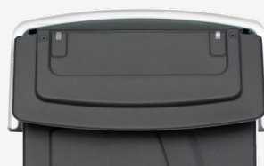
Retractable roof (shown down)