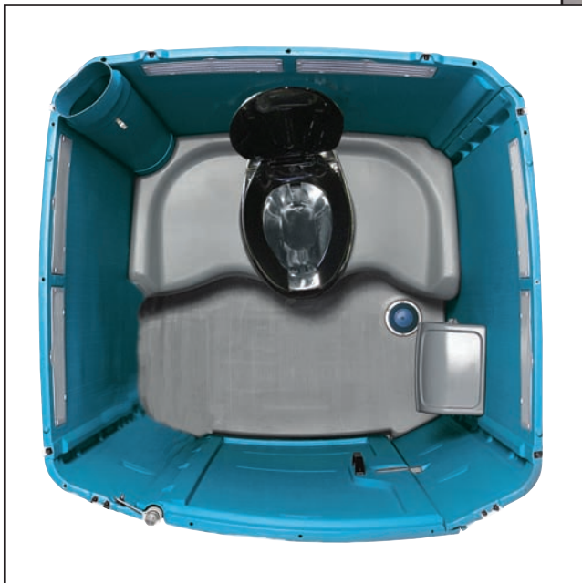
Sleek clean lines & no gaps around the tank's base for debris