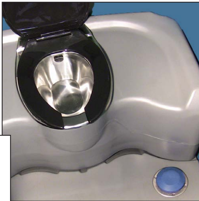
Stainless steel bowl & freshwater foot flush