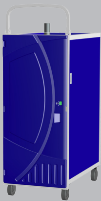
Unit without roof